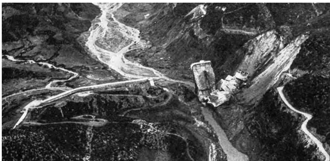
Fig. 8. The remains of the St Francis Dam very soon after its almost total collapse. The largest blocks of concrete were not moved far by the floodwaters and lie beside the central, tombstone remnant that survived. The landslide scars are conspicuous on the eastern abutment, on the right. The western wing wall still stands along the crest of the natural rock spur left of the breached dam.

geology, were coming together and were heading only towards disaster.