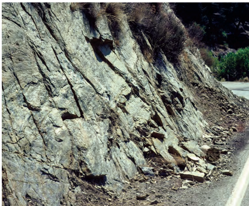
Fig. 7. Post-collapse, road-side exposure of the Pelona Schist remaining beneath the scoured channel at almost exactly the position of the dam.

which dissolved rapidly in flowing water.