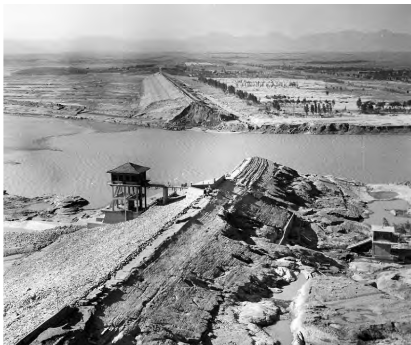
Fig. 9. Remains of the failed Banqiao Dam in eastern China.

All or some of these initial movements rapidly evolved into a much larger landslide that saw displacement of the entire eastern abutment of the dam. Around half a million cubic metres of the hillside moved downwards and downstream, failing along pre-existing slip surfaces and along the pervasive schistosity. It carried the eastern half of the dam with it. Slide debris and scoured bedrock were washed far down the canyon by the escaping floodwaters. So was much of the dam, though the largest intact blocks were just undermined and strewn around the canyon floor closer to the dam site. This landslide was the key factor in the destruction of the St Francis Dam. Its