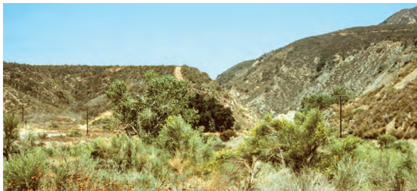
Fig. 1. The San Francisquito Canyon as it appeared in 1979. The dam had been built in the V-shaped section to the right of the natural spur of rock extending from the left. On the far right, on what was the eastern abutment, the scar of the main landslide is a slope of grey schist with sparser vegetation than on the slope above.