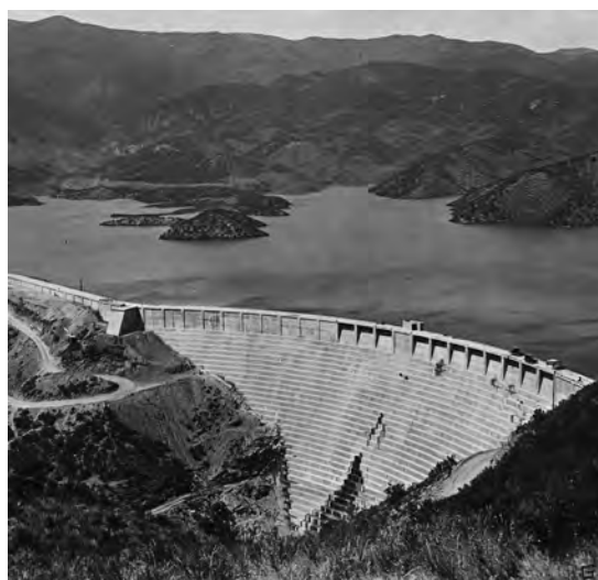
Fig. 3. One of the few photographs of the reservoir after filling and of the dam before failing.

There were other contentious issues with respect to the dam's design. The dam was built on bedrock that had been cleared only to depths varying between one and four metres beneath the original, weathered,